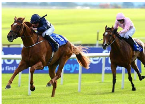
New Bush Hill stallion Flying The Flag, by world champion Galileo, is full brother to the ruling favourite to next year's One Thousand Guineas and Oaks, Rhododendron

If all goes to plan, Tapit will become the first since Smart Strike (Mr Prospector) to head the US General Sires List three years running. Only a handful of stallions achieved prior to that, including Danzig (Northern Dancer), Bold Ruler (Nasrullah) and Bull Lea (Bull Dog).