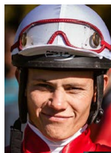
Log leaders Richard Fourie & Justin Snaith part company