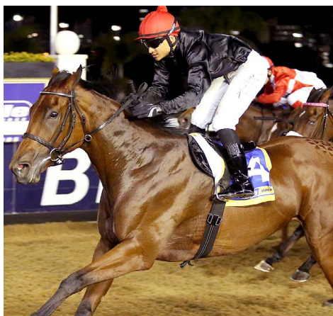
Nightingale has the ability to win | Gold Circle

Team Tarry aren't scared to travel and the move to take on the older established locals with lightly raced Tambalang is a vote of confidence and also a test of her