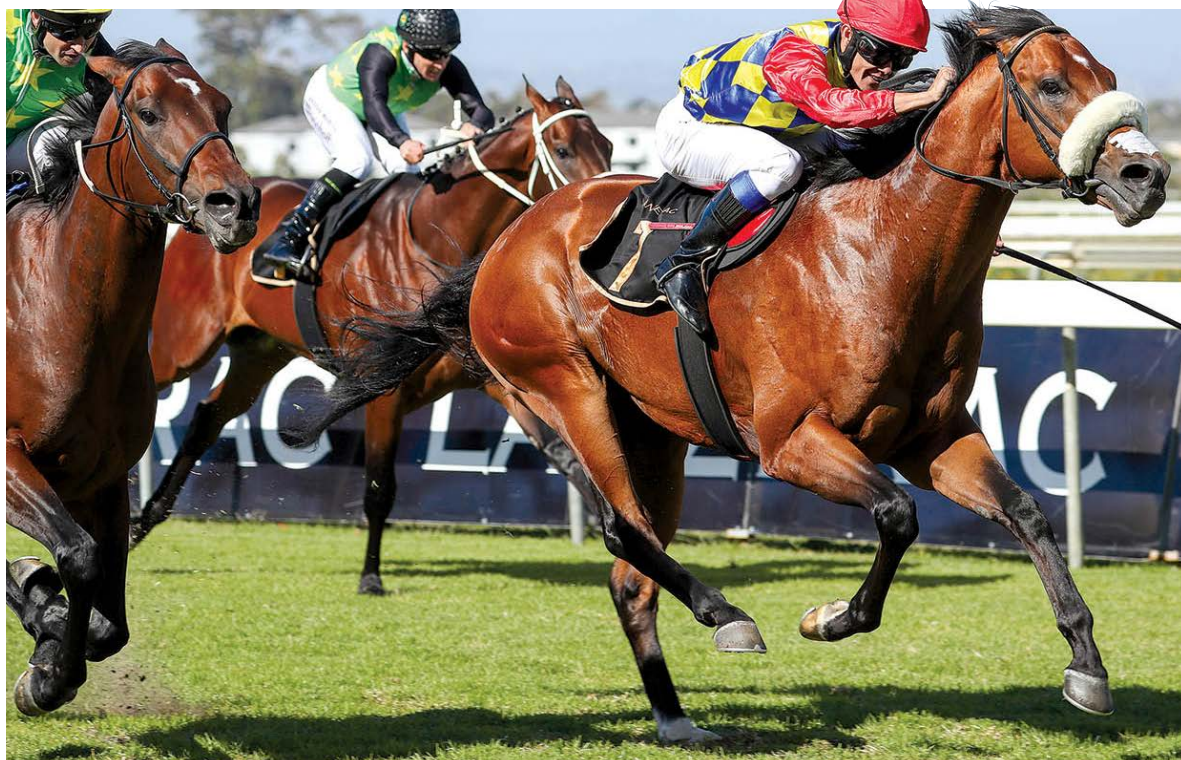
Selangor Cup winner Gold Standard has a point to prove