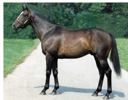
Roberto can still be found in the pedigrees of the world's top racehorses