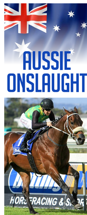
Table Bay | W Marks

**Breeding operations not based in RSA - Statistics for Breeders &amp; Sires reflect ALL earnings, incl. restricted races &amp; handicap races