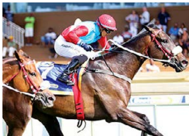
KZN raider Sabre Charge has won twice over the distance