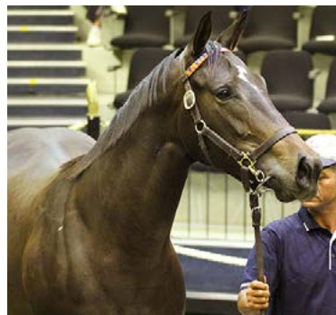
Record Breaker VAR filly #395