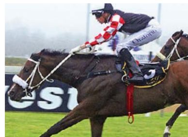
The East Cape Nursery winner Fort Winter looks set to follow up on Saturday | Gold Circle

Green Field made an unsupported debut last Friday when third to Trap Lord, and can only improve.