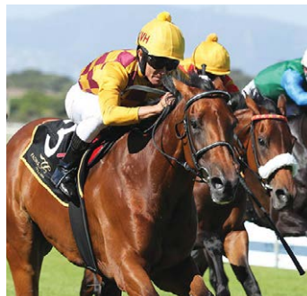
The consistent Goodtime Gal enjoys the 1800m test | Wayne Marks

Another opportunity for much sought after black type is presented to some of our soon-to-be paddock princesses in the R250 000 Gr3 Final Fling Stakes to be run over the winter course 1800m at Kenilworth on Saturday.