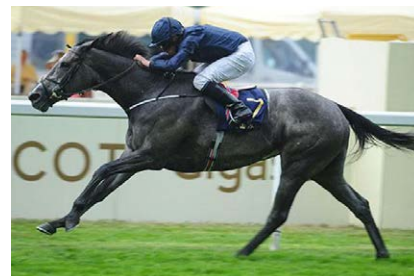
The Galileo filly, Winter

The Galileo filly, trained by Aidan O'Brien for a Coolmore partnership, has gained decisive Gr1 victories in the QIPCO 1000 Guineas, the Tattersalls Irish 1,000 Guineas and the Coronation Stakes, all at a mile, and is on target for the 10-furlong Gr1 Qatar Nassau Stakes at the Qatar Goodwood Festival on Thursday, August 3.