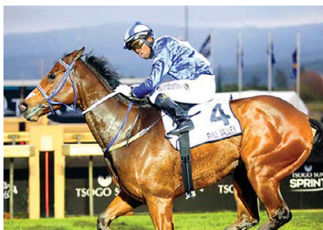
Bull Valley | Gold Circle