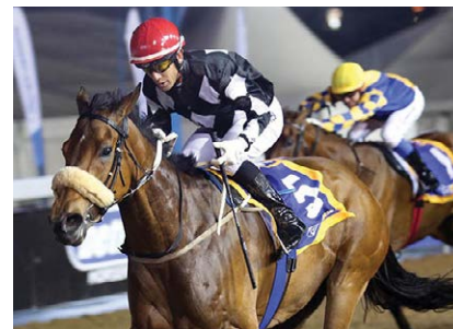
Peach Delight | Gold Circle

There is plenty of talent simmering just below the surface and it is best to go as wide as the budget allows in the Pick 6.