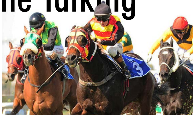
Copper Parade - Gr1 winning son of Lecture

Another Johannesburg son to make his mark was Teuflesberg, who is responsible for Gr1 Breeders' Cup Sprint winner, Trinitberg, while Johannesburg son, Red Jazz, currently ranks among the ten top first crop sires in Britain.