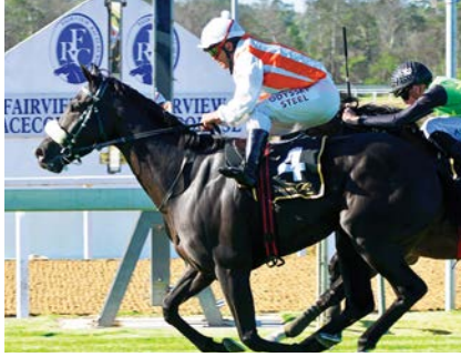
Gimmethelight's daughter Beataboutthebush has plenty in her favour

Peach Delight and Crackpot could lift the quartet dividend at their best.