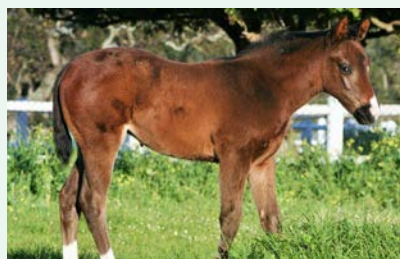
Var x Jet Set Go bay filly - 1/08/17