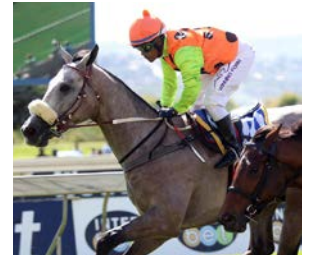
Secret Captain | Gold Circle