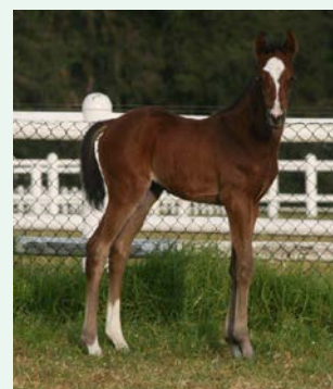
Flower Alley x Count The Cash bay filly 13.09.17 (Avontuur)