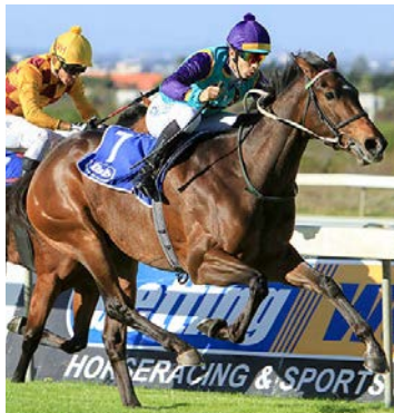
Captain's Flame wins 2016 Diana Stakes