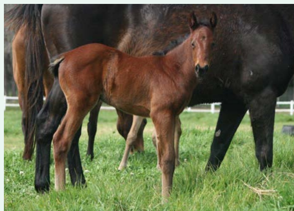
Veringetorix x Classique Story bay filly 08.09.17 (Avontuur)