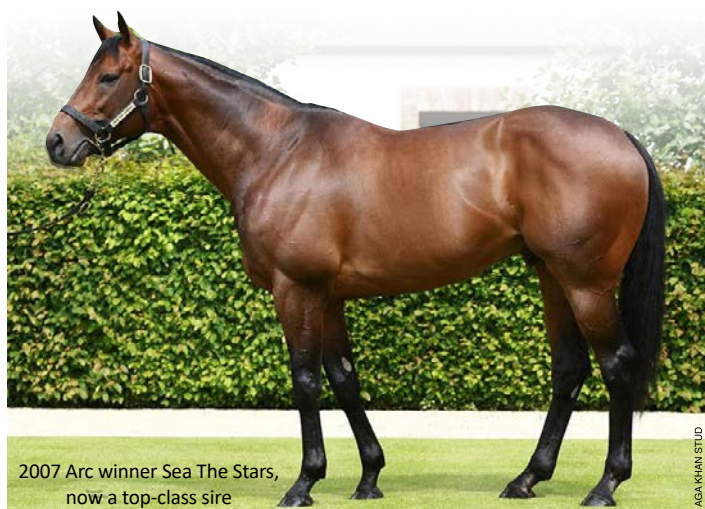
2007 Arc winner Sea The Stars, now a top-class sire

Retired to stud in 2001, Montjeu became champion sire in France after Hurricane Run won the Arc, and left behind a tally of 13 English or Irish classic winners, including Investec Derby hero, Pour Moi, whose son, Wings Of Eagles, won the 2017 English Derby. Montjeu also accomplished a remarkable feat when first crop sons, Motivator (sire of dual Arc heroine, Treve) and Walk In The Park ran 1-2 in the 2005 Vodafone Derby.