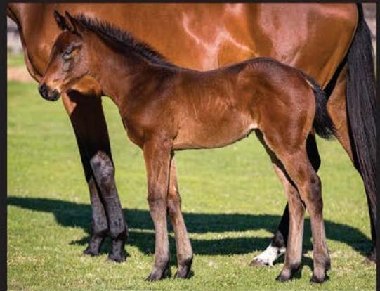
FILLY ex Hope Downs (Fort Wood)