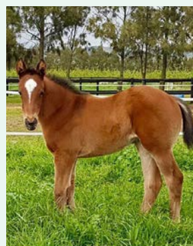
Oratorio ex Boloval filly 01.08.17 (Winterbach Stud)