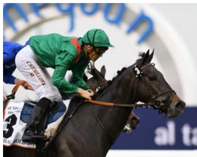
Vazirabad (FR) winner of the Dubai Gold Cup boasts a record of 12 wins from 17 starts

Three races in the 2018 Dubai World Cup Carnival programme have been upgraded, adding thunder to an already exceptional international racing calendar at Meydan Racecourse.