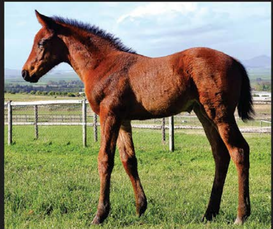
FILLY ex Ilium (Ideal World)