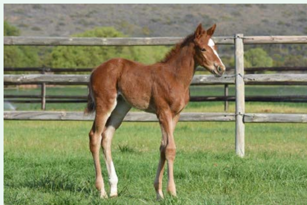
Pathfork x Stargazer Pink filly 07.09.17 (Highlands Stud)