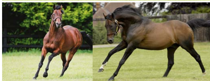
Arc winners who produced Arc Winners - Montjeu (1999) (left) sired Hurricane Run (2005) and Rainbow Quest (1985) (right) sired Saumarez (1990)