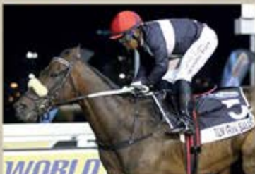
TEN GUN SALUTE