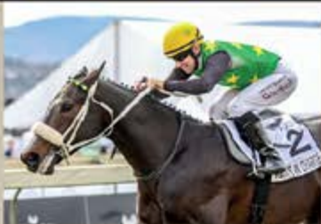
ALWAYS IN CHARGE