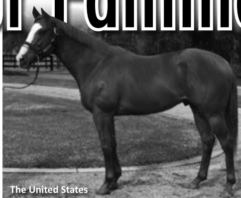
The United States

Proven sire, Duke Of Marmalade (Danehill), is out of an exceptional broodmare in the form of Love Me True (Kingmambo). The latter, also dam of Gr1 Investec Derby winner and Coolmore sire, Ruler Of The World (Galileo), and dual Derby placed, Giovanni Canaletto (Galileo), was represented by her third group winner when her son, Annus Mirabilis (Montjeu) won the Gr2 UBET Adelaide Cup earlier this year. Love Me True is herself a sister in blood to US champion and red hot US sire, Lemon Drop Kid, sire of 2017 Gr1 winners, Beach Patrol and Romantic Vision, among others.