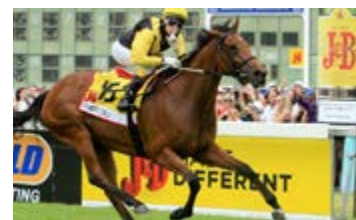
Smart Call winning the Met

While the connections of the 2017 Met winner Whisky Baron recently indicated that their champion would give Hong Kong a miss and be aimed at the Dubai World Cup, the son of Manhattan Rain is one of two South African nominations, along with 2016 Met winning mare, Smart Call.