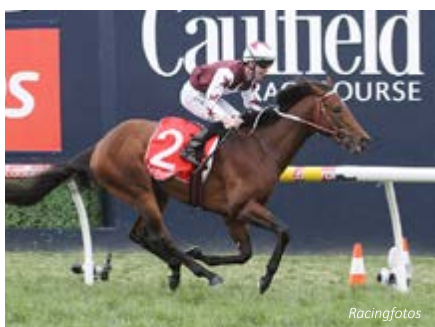
Cliff's Edge winning Ladbrokes Classic