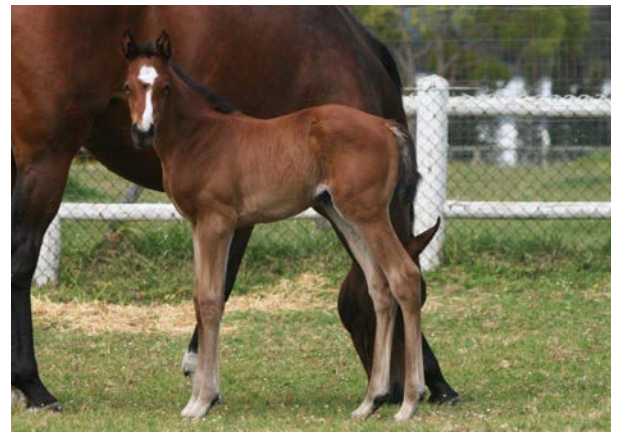
Oratorio x Hannah Gorgeous bay filly 13.09.17 (Avontuur)