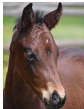
Potala Palace x Above Emeralds filly 19.09.17 (Highlands Stud)