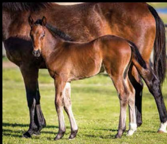
COLT ex Twinkle Star (Counter Action)