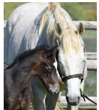
Pathfork x Silky Lily filly 20.09.17 (Highlands Stud)