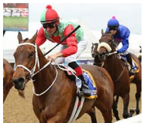
Zen Arcade | Gold Circle