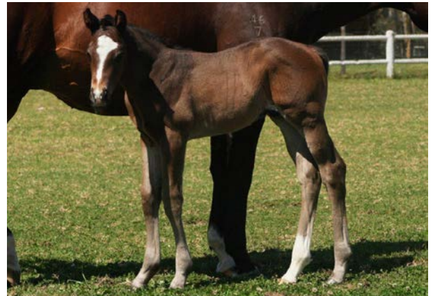
Var x Torra Bay bay colt 13.09.17 (Avontuur)