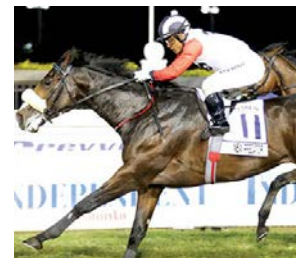
New Predator

New Predator and Will Pays. Watch the promising 3yo's at the bottom of the weights for a possible surprise.