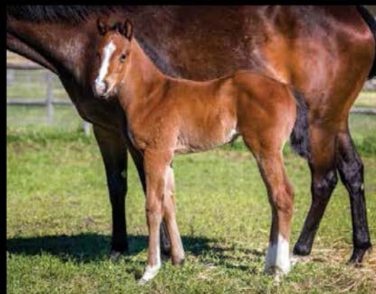
COLT ex Light of Dawn (Trippi)