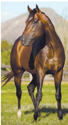
Pathfork