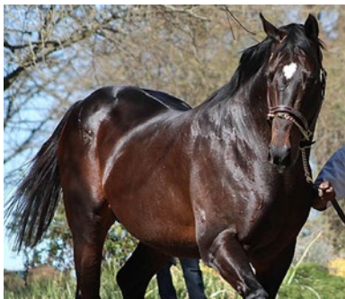
Toreador

The KZN breeding fraternity have lost a high-class stalwart with the sad news that Danehill stallion Toreador was euthanized at Bush Hill Stud on Sunday morning.