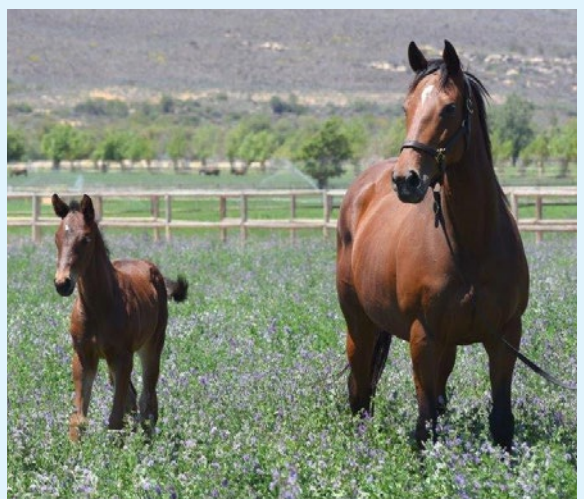
Dynasty X Careful Hiker colt born 01.11.17 (Highlands Stud)