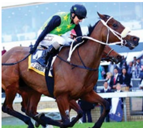
Just Sensual