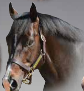
WHAT A WINTER