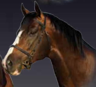
MASTER OF MY FATE