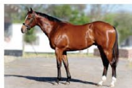
LOT 50. QUERARI X ARCTIC BREEZE