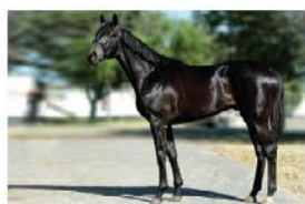
LOT 54. QUERARI X CARLAS WISDOM