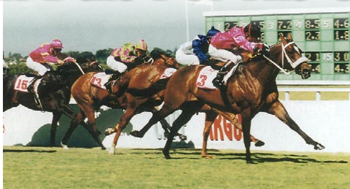
Captain Al winning the Gr1 Cape Guineas

In fact he is sure to be well represented in the majority of the