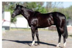
LOT 12. WHAT A WINTER X SHAKARA