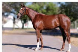
LOT 1. WYLIE HALL X RACHEL LEIGH