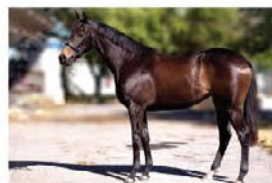
LOT 88. QUERARI X KEY TO HEAVEN