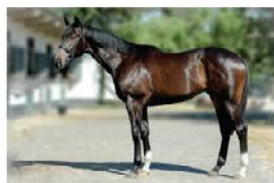
LOT 116. QUERARI X PRIMA DONNA