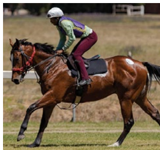
Lot 50: Rio Querari