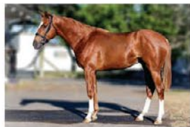
LOT 94. WYLIE HALL X LAVENDER BELLS