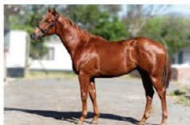
LOT 28. DUKE OF MARMALADE X TIPPUANA