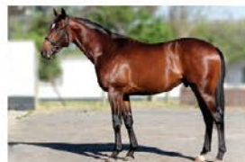
LOT 36. QUERARI X WEST TO EAST