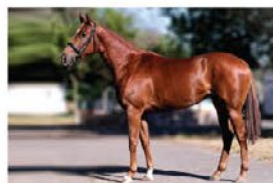
LOT 86. WYLIE HALL X JOLLY ALONG