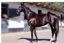
LOT 39. QUERARI X YEKATERINA