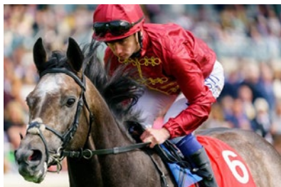
Roaring Lion is Cartier Horse Of The Year