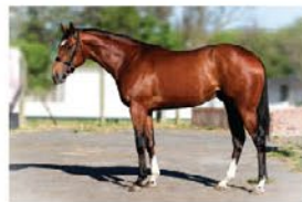
LOT 100. JACKSON X MARRY FOR MONEY