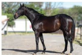
LOT 4. WYLIE HALL X RED BOOK