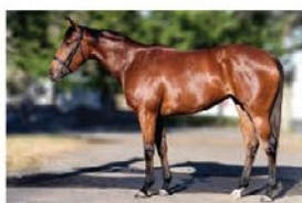
LOT 55. PATHFORK X CARMINA