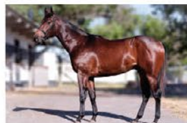
LOT 33. WYLIE HALL X VIRGO'S BABE