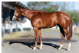
LOT 97. JUDPOT X MADAM CARLA