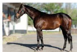
LOT 81. CAPTAIN OF ALL X HYDEPARK GIRL