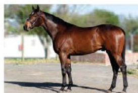
LOT 41. VERCINGETORIX ZAITOON