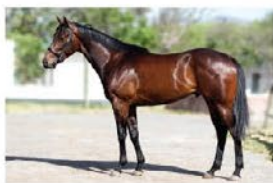
LOT 84. QUERARI X JANIS