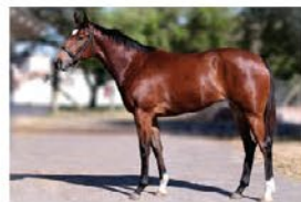
LOT 17. WYLIE HALL X SILENT TREATMENT