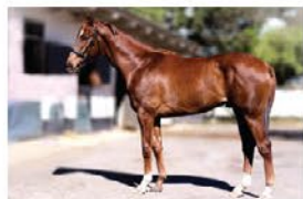
LOT 20. TWICE OVER X SPANISH GOLD