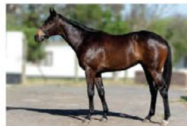
LOT 113. SEVENTH ROCK X PACIFIC LIGHTS