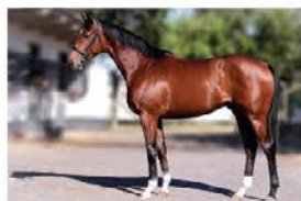
LOT 83. QUERARI X IRISH CRYSTAL