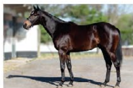
LOT 38. SEVENTH ROCK X WOOD MANOR