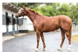
LOT 75. WYLIE HALL X GIANT'S SLIPPER