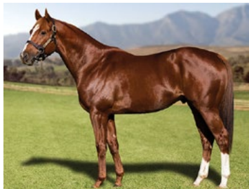
Coup De Grace

A top class sprinter, who ranked among the leaders of his generation, Coup De Grace's five victories included the Gr2 Amsterdam Stakes and the historic Gr3 Bay Shore Stakes. He also won the Oh Say Stakes and ran a close up third in the Gr1 King's Bishop Stakes at Saratoga.