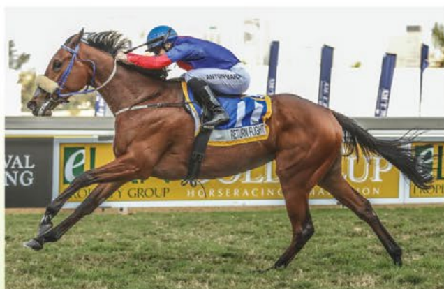
Equus CHAMPION 2yo Filly RETURN FLIGHT , from the very first crop of POMODORO, winning the Gr1 Thekwini Stakes.

Pomodoro's 3rd crop are Cape Premier Sale Yearlings. Like so: