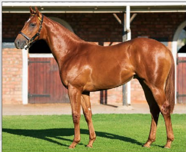
Lot 201 colt by Vercingetorix - Thru' the Tulips by Al Mufti (USA)

EXCEPTIONAL INTERNATIONAL ACHIEVEMENT BREEDER OF THE YEAR AWARD 2012