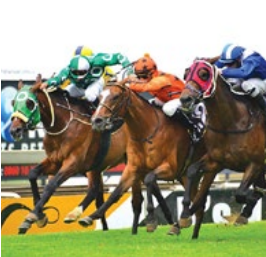
Pietro Mascagni