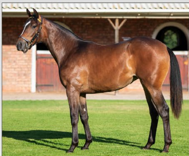
Lot 139 filly by Captain Al - Platinum Princess by Rakeen (USA)