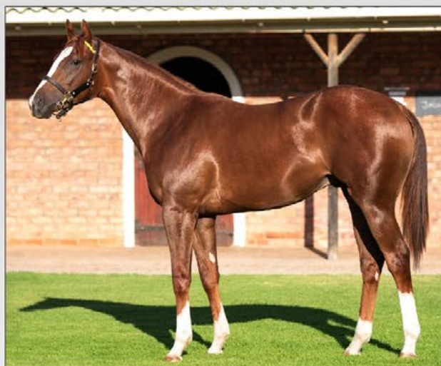
Lot 182 colt by Var (USA) - Sommermärchen (GER) by Pentire (GB)