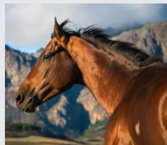
Futura | Drakenstein Stud Farm