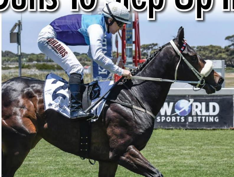
Vercingetorix debut winner Fearless Warrior

Another son of Redoute's Choice whose first South African runners are two this season is Zeditave Stakes winner Time Thief. A three-parts brother to champion filly Laisserfaire and from the family of champion sire Centaine, Time Thief made his mark overseas through his Gr1 Galaxy winning millionaire daughter In Her Time. His first local starter, Rooi Tom, ran fifth at the Vaal over