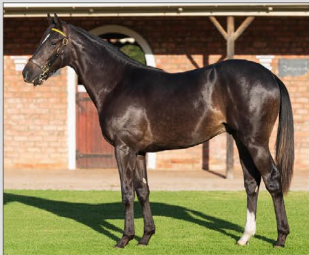
Lot 76 colt by Querari (GER) - Hollywood Dreams by Victory Moon

16 yearlings (10 colts, 6 fillies) on offer from South Africa's Leading Breeders