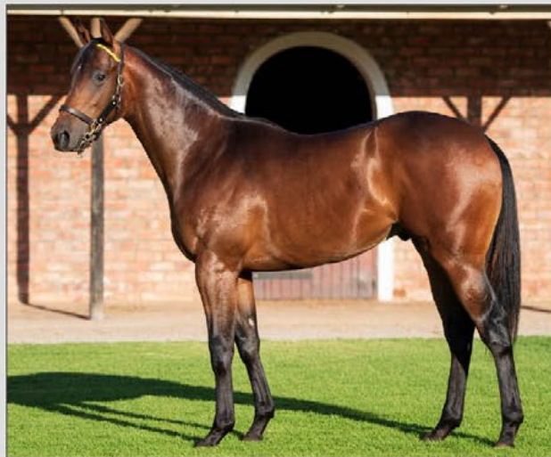
Lot 137 colt by Silvano (GER) - Pine Princess by Captain Al