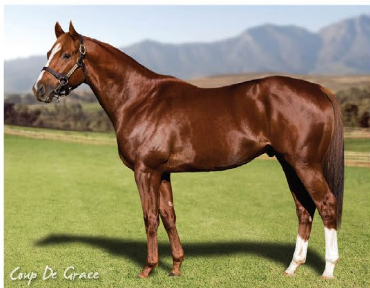
Coup De Grace

son of Tapit three-times Champion Sire in USA sire of 114 SW at 9% SW/rnrs, with 27 G1 winners at 2% G1 wnrs/rnrs sire-of-sires Frosted, Constitution, Tapwrit, Tonalist, Tapizar, etc.