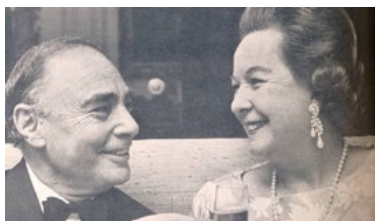
Harry and Bridget Oppenheimer