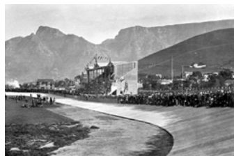
Green Point Common, 19th Century

The end of the Anglo-Boer War and the formation of the Union of South Africa saw an upsurge in the popularity of horse racing. The Second World War saw all races move to Milnerton Racecourse as the military took charge of Kenilworth. In 1955 all races again took place at Milnerton during the building of the main stands at Kenilworth.