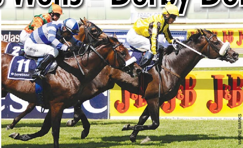
Capetown Noir - Gr1 Cape Derby, 2013

Another son of Sadler's Wells, Casey Tibbs- whose progeny included 2009 Cape Derby winner and subsequent Equus Champion, Big City Life- has established himself as a successful broodmare sire, with Casey Tibbs mares having already produced the likes of Gr1 winners Do It Again and Do You Remember, high class Hong Kong performer, Horse Of Fortune (aka Strongman) and July runner up, Made To Conquer. Casey Tibbs is represented as a broodmare sire in this year's Cape Derby by Line Editor (Jay Peg).