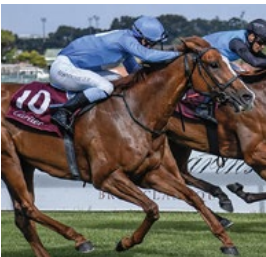
Clouds Unfold