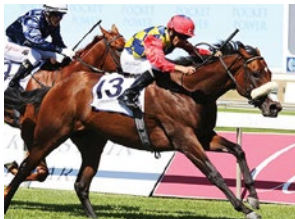
Eyes Wide Open

With half the field in contention for a Sun Met berth on 26 January, there will be plenty to play for in the Gr2 Peninsula Handicap at Kenilworth on Saturday. While he has some ground to make up on his recent form, last year's winner Eyes Wide Open may be a good starting point.