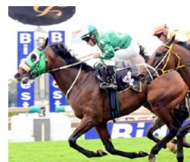
Dawn Assault