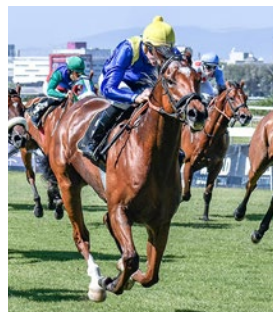
Rainbow Bridge

Reigning champion Legal Eagle faces what looks to be the ultimate challenge of his illustrious career on Saturday. Unbeaten at ten starts over a mile and bidding for his fourth consecutive L'Ormarins Queen's Plate victory, the head and the heart tells us he can do it again – but it won't be a walk in the park, in what is a premier quality field.