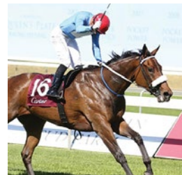
Oh Susanna