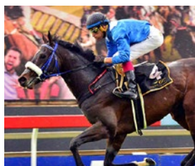
Hawwaam