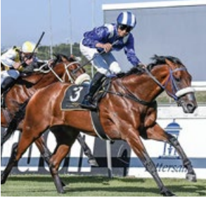
Soqrat |Chase Liebenberg

Now a 7yo, Will Pays secured the national sprinting accolade in a season considered ‘relatively weak’ by certain sections of the racing media. That is after the four open Gr1 sprints were won by different horses and ultimately left the wise men on the panel with a headache. But that’s all history now and the Northfields gelding is looking for a ‘lucky’ thirteenth victory when he steps out on the Turffontein standside 1400m under top weight on Saturday.