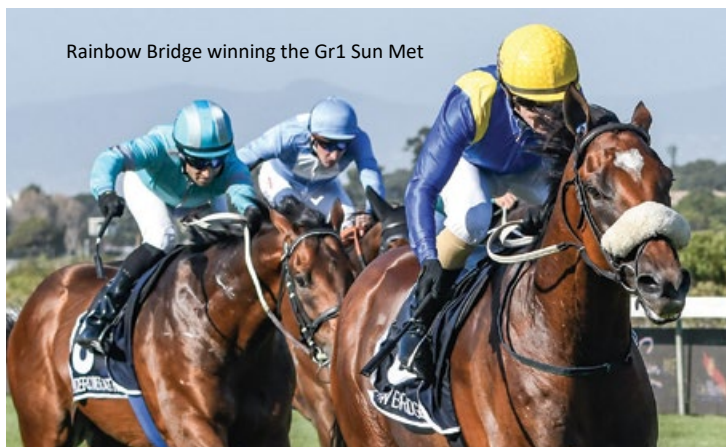
Rainbow Bridge winning the Gr1 Sun Met