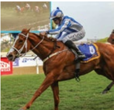
Camphoratus [Gold Circle]