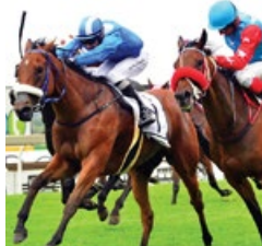
Nafaayes