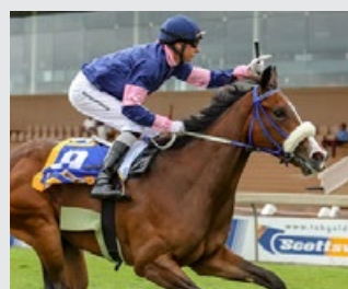
Yessiricanboogie

A fortuitous KZN Breeders Golf Day voucher led to the purchase of a quick filly at the KZN Yearling Sale who broke the ice on debut for Redoute's Choice stallion Time Thief at Scottsville on Wednesday.