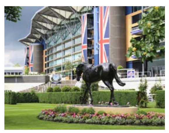
Yeats in the Ascot parade ring | Charlie Langton

cause art is a two way relationship- by some of the greatest horses of our time. Charlie feels it is important to have an accurate visual reference of our really great horses to record, preserve and share them for posterity. But what makes it important? Yes, one wants a physical representation in order to capture and record them in order to work out what made them great. But I think it's possibly as simple as Churchill's wonderful words that there is some-