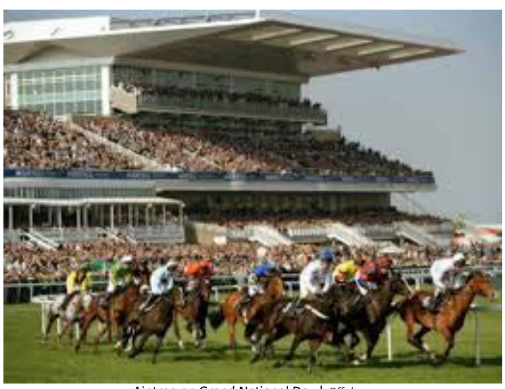
Aintree on Grand National Day | Offaly express