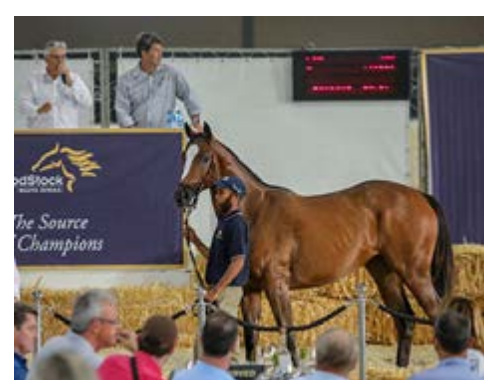
Soft Falling Rain filly - top lot 167 | Candiese Marnewick

The son of Jet Master averaged well above the average at the sale, with Pomodoro's top lot being a colt out of Crissy Sanchez who was sold to Rainbow Beach Trading for R200 000.