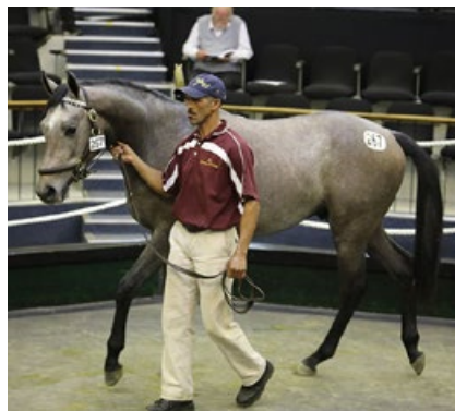
Joint topseller, a full brother to Bela-Bela & Rabiya

When the going gets tough, the tough get bidding! The 2019 Emperors Palace National 2yo Sale wrapped up on Friday with some pleasing numbers – and the highest aggregate in five renewals.