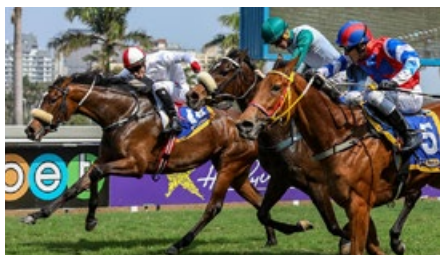
American Princess

The son of Equus Champion Promisefrommyheart made a dazzling start with his first crop including Guineas winner Twist Of Fate, Kenyan Triple Crown hero Silverstone Air, Derby Trial winner Gift For The Gap, and the smart pair of Triple Fate Line and Mastagambit.