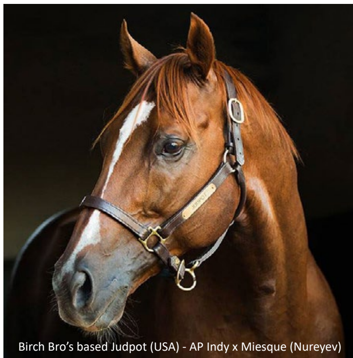
Birch Bro's based Judpot (USA) - AP Indy x Miesque (Nureyev)

Love Me True's sire, Kingmambo, is also broodmare sire of promising sire, and four time Gr1 winner Camelot, whose son, Sir Dragonet, ran fourth in Saturday's St Leger, and Kingmambo is also broodmare sire of Sky Crystal, whose son, Space Traveller, won both Saturday's Gr2 Clipper Logistics Boomerang Stakes, and June's Gr2 Jersey Stakes. Kingmambo's successful sire sons, Lemon Drop Kid and King's Best- a three-parts brother to the remarkable Urban Sea- have both proved top-class damsires, and King's Best is broodmare sire of this season's high-class 3yo, Headman, as well as 2019 group/graded stakes winners, I'm So Fancy, Nomandel, and Juliet Foxtrot.