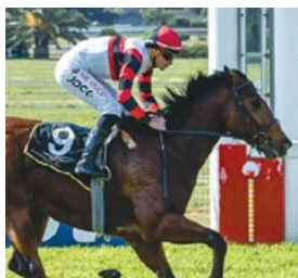
Three Two Charlie

With much of the field having their first run as a 3yo, Western Cape racing's opening feature of the season, the R150 000 Listed Sophomore Sprint, sets the tone for what should be a sizzling summer on all fronts.