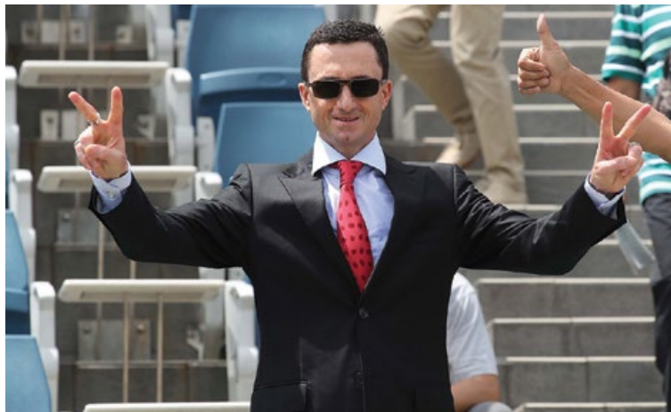
Douglas Whyte celebrates his first win as a trainer | HKJC.com

South African racing fans enjoyed a thrilling opening to the 2019/20 Hong Kong Racing season at Sha Tin on Sunday with Cape star rider Aldo Domeyer booting home a double and the Durban-born Doug Whyte saddling his first winner as a trainer.