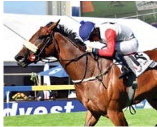
True To Life

Recent Magnolia Handicap winner True To Life is an interesting runner in Saturday's R1 million WSB Gr1 Cape Fillies Guineas. The daughter of Duke Of Marmalade has produced her best form over the sprints but her connections are showing faith in her breeding, which suggests she will get the mile with ease.