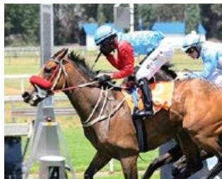
Dan The Lad | JC Photos

The record Summer Cup day Pick 6 pool that ended up paying over R5 million will be fresh in the minds of players looking for a festive boost and big dividends look to be on the cards.