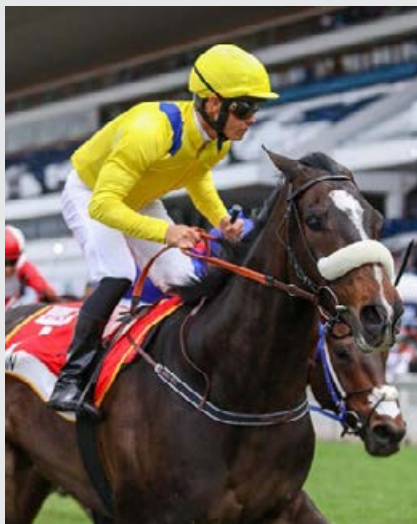
Do It Again

Reigning Equus Horse Of The Year Do It Again is the senior rated galloper at 136 for the Gr2 Green Point Stakes at Kenilworth on Saturday 14 December.