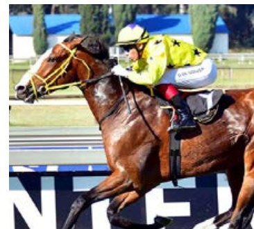
Seattle Force

The Noble Tune grey White Lightning is the first of the Paul