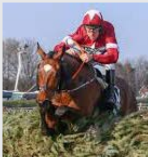
Tiger Roll