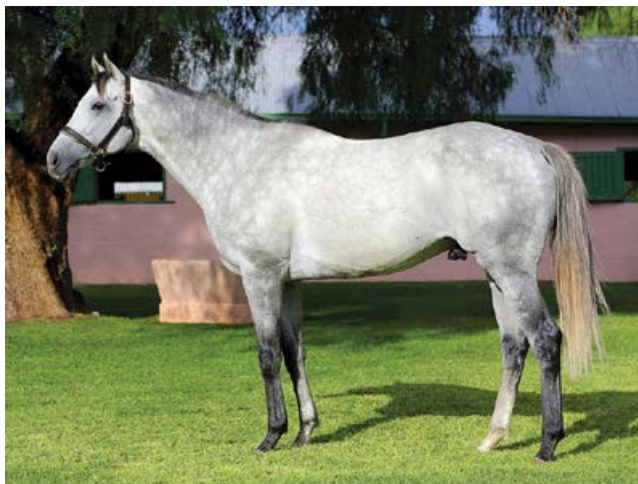
Danon Platina - only son of Deep Impact at stud in SA

Incidentally, both Danon Ballade and Tosen Ra have connections