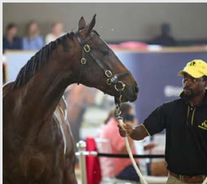
Top lot #104, Edgartown, a son of Soft Falling Rain

KZN-based Pound Bloodstock acquired the top two selling lots – both sons of deceased champion Soft Falling Rain – at the 2020 BSA Cape Yearling Sale held in glorious summer weather at the Mistico Equestrian Centre near Paarl on Friday.