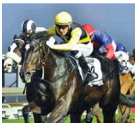
Summer Pudding