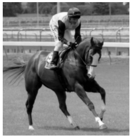
Joker's Wild, champion 2yo from the first crop of Black Minnaloushe - his dam carries six lines of Mumtaz Mahal

Copelina was sent to Fine Top, a stallion whose pedigree doubled up on elements highlighted earlier in the mare's background: Le Sancy, Sans Souci, Bruleur and Blandford. The result of the